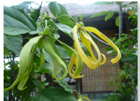
Wild Ylang Ylang picked only in early morning

method of measurable, quantifiable authentication to approve all oils.