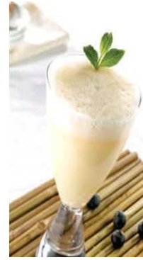
Vanilla Ice Cream Rave!

Essanté ORGANICS 7.365 pH SHAKE is an outrageously delicious & nutritious meal replacement shake that makes it easy to alkalize, energize & metabolize! 7.365 pH SHAKE targets and incinerates fat faster while amplifying your energy & balancing your pH levels! How? It's easy because with 7.365 pH SHAKE you'll ENJOY ALL OF THE GREAT ingredients & AVOID ALL OF THE BAD ones. One of the reasons we gain weight is when we consume toxins, our body protects us by creating fat cells and storing those toxins within. Essante' ORGANICS 7.365 pH SHAKE is 100% chemical free AND has all the nutrition & the perfect pH balance your body needs to be healthy. Our 7.365 pH SHAKE uses a groundbreaking high-quality vegan protein formulation proven to facilitate weight loss in 3 ways: ALKALIZE, ENERGIZE & METABOLIZE "7.365" 7 days a week, 365 days a year!